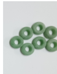
Elastic bands (rings)