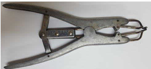
Elastrator ring applicator

When using elastrator bands, bull calves should be castrated before weaning. The bull calves can be castrated at the time of disbudding.